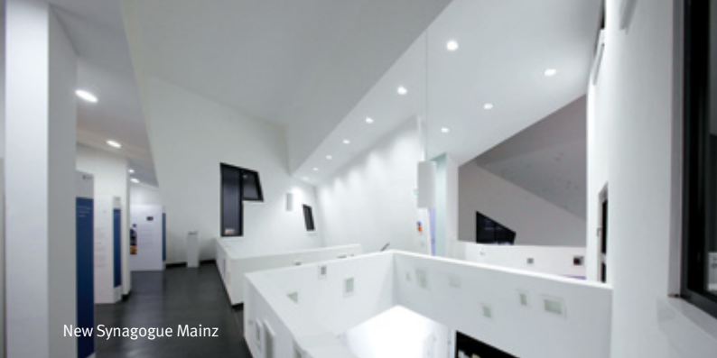
New Synagogue Mainz