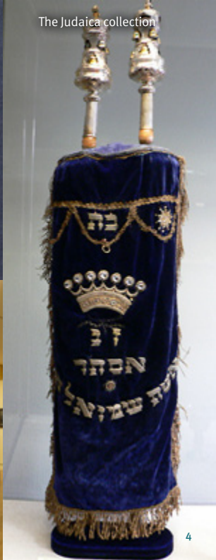
The Judaica collection