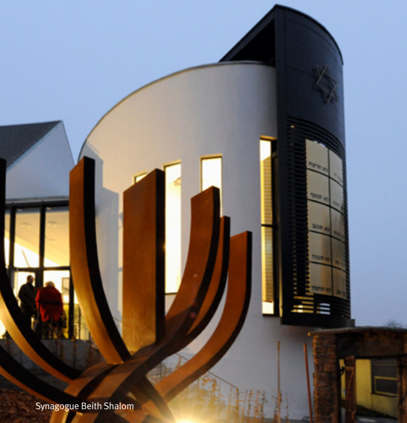
Synagogue Beith Shalom