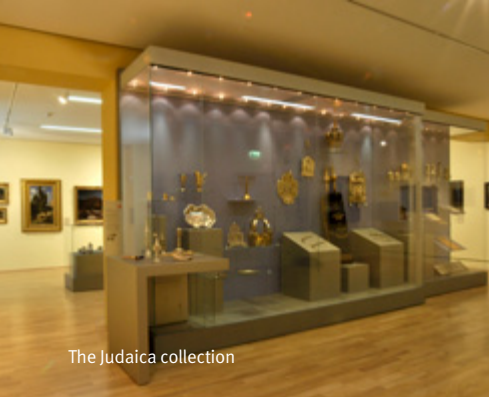
The Judaica collection