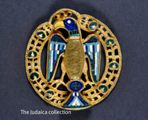
The Judaica collection