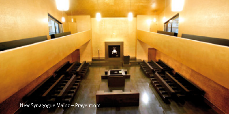
New Synagogue Mainz – Prayerroom